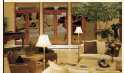
Traditional window films cause reflectivity in home interiors at night.