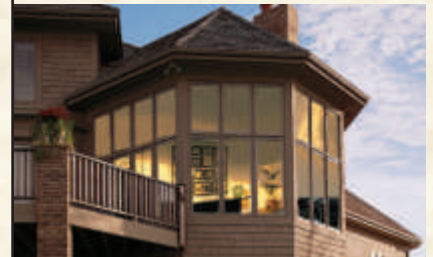
3M's latest technology does not use metal, leaving the appearance of your home unchanged.