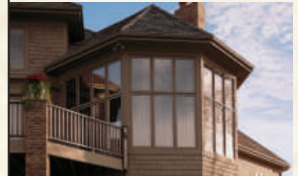
Traditional window films use metal which causes reflectivity.