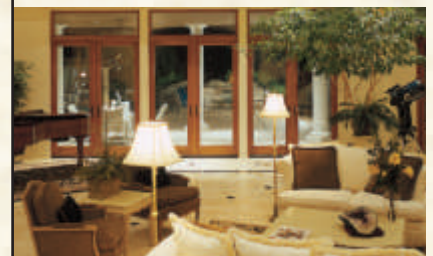
These unique 3M films maintain normal visibility outside at night.